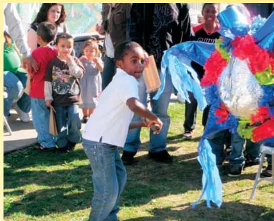
What's a party without a "Piñata"?