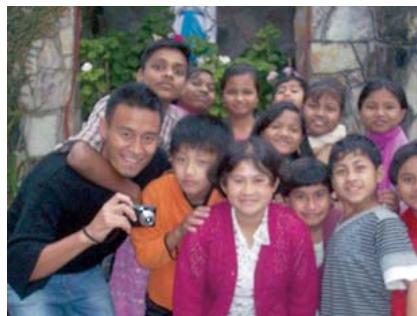
Children from Ferrando Speech & Hearing Centre in India

Every day, even though I get more sleep, I miss the children, and I feel like not using sign language for the past couple of weeks, I'm getting rusty! I hope the children can still understand me when I get back....I miss the way some of the kids will just jump on my back and slowly slide down to my lap until they're sitting or lying comfortably on my lap, or the way some of the kids will fall asleep on my lap while watching T.V. after a long day of studying and playing, or the way they run to hold my hands after school because they haven't seen me in a couple of hours.