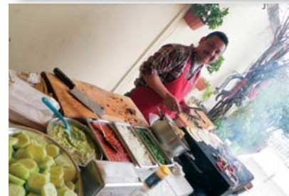
Tacos "El Tio"- A parishioner cooking for the missionaries