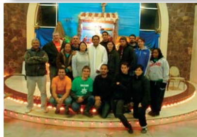
Group picture at San Jose Oratory