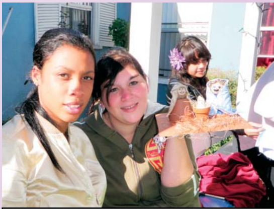
Mothers holding their Nativity craft

On December 24th we met the young people who would be participating in this Pastoral Event. We studied the word of God, we prayed shared our feelings before going to the event. We made sure that young people understood that what they were doing was our Christian responsibility. We were going to visit Jesus in the most needy.