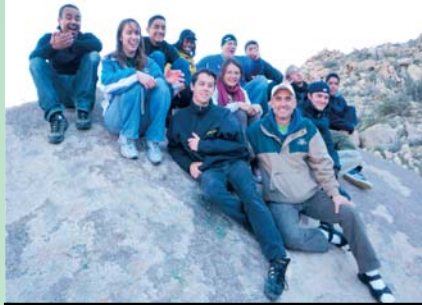
Gospel Roads Missionaries enjoying a field trip