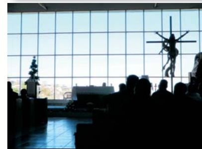
View from St. Dominic Savio Oratory Chapel