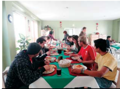
Missionaries sharing a table

This experience has really changed my view of the world. Even though we have everything here in the U.S we still complain, because we don't have the nicest car, or latest game system. We get so consumed by this materialistic point of view that we truly forget how blessed we are. This trip has made me realize how blessed I am in my life just to have a roof over my head, and I appreciate everything more than I did before my experience. During this trip I confirmed that serving people, as a missionary is my calling from God. I have already started my formation to be a volunteer. I am open to go wherever God needs me.