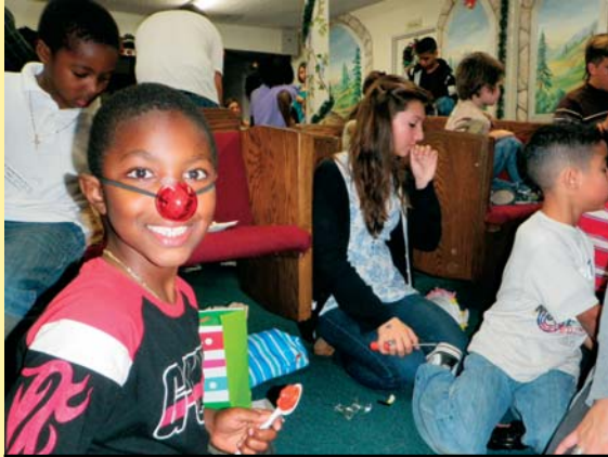
Free to clown around with Salesian friends

While in the activity, we the youth ministers, try to be present to them. We accompany them while they are sharing time with the children and mothers. Once the activity is ended, we gather again and ask them to express their feelings. We ask them to share with us where they saw Christ. This last reflection is the most important, because here we give them