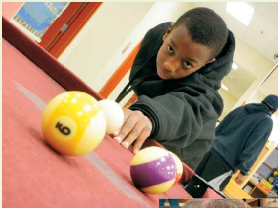
Having fun after doing homework!

My duties as a Salesian volunteer at the Salesian High School calls me to collaborate with the Campus Ministry to plan activities for the students. This also includes student retreats. I also act as a student service liaison with the Boys and Girls Club, promoting and facilitating the students tutoring and coaching services at the Boys and Girls Club.